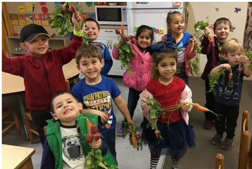
Look at our bounty from the Garden of Eatin'. We planted, maintained and harvested these cool veggies!