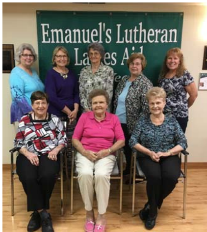
Current members whose mothers were in Ladies Aid years ago.