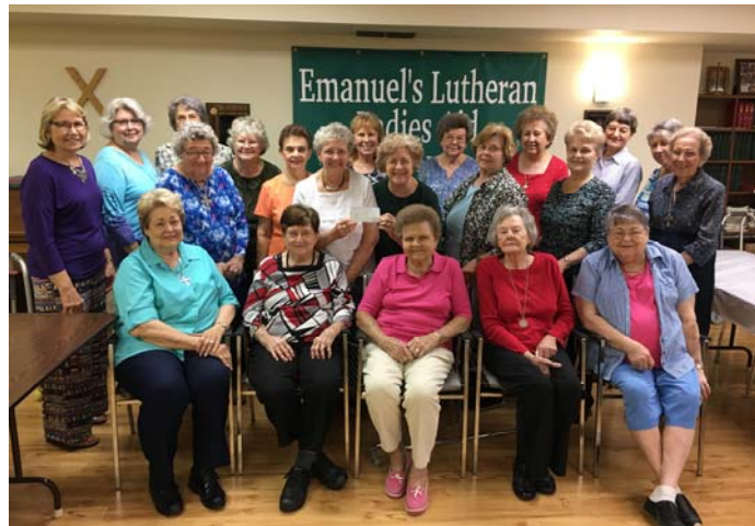
Emanuel's Ladies Aid donating money to the Christian Cupboard.